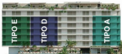
UBICACIÓN EN FACHADA

Superficie interior _____ 160.59 m 2 Superficie terraza _____ 51.18 m 2 Superficie total _____ 211.77 m 2 # Cajones _____ 2